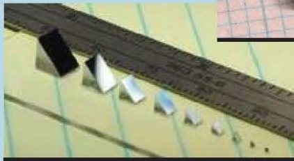
This photo shows coated prisms.