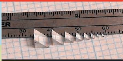
This photo shows uncoated prisms.