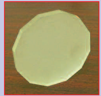
12 sided Optic Scanner Prism